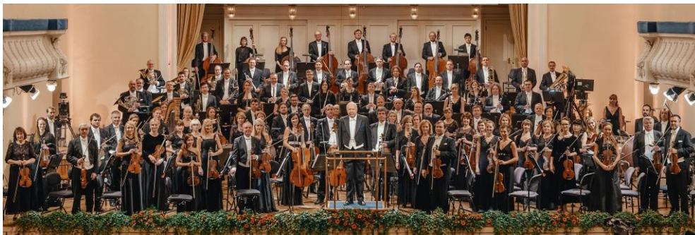
Estonian National Symphony Orchestra and Neeme Järvi.

See also: Estonian National Symphony Orchestra