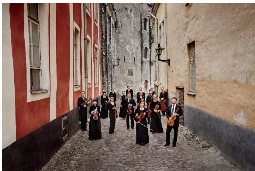
Tallinn Chamber Orchestra.