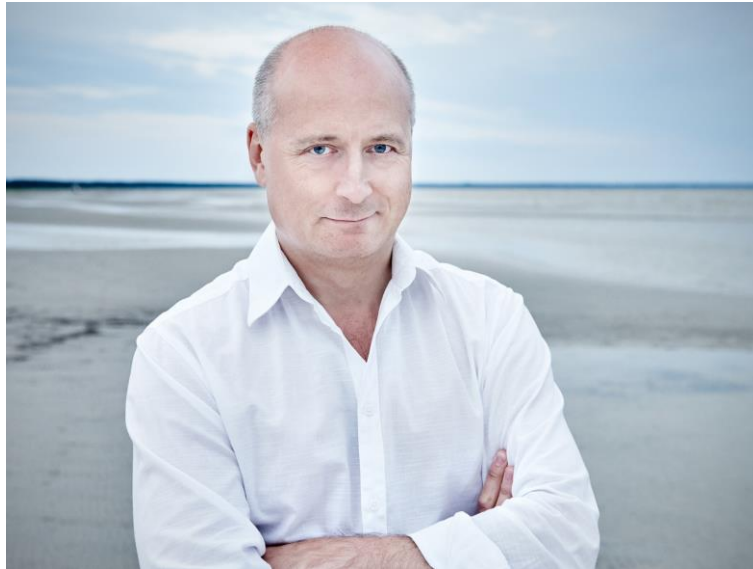
Paavo Järvi.