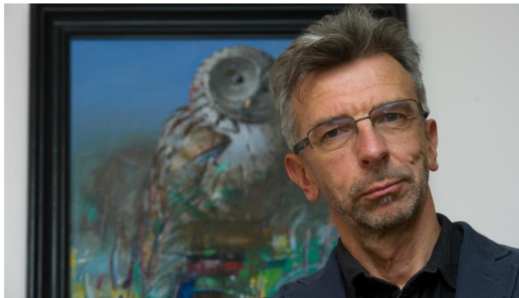
Erkki-Sven Tüür.