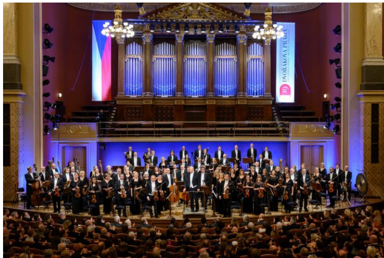
Estonian National Symphony Orchestra.

See also: Estonian National Symphony Orchestra