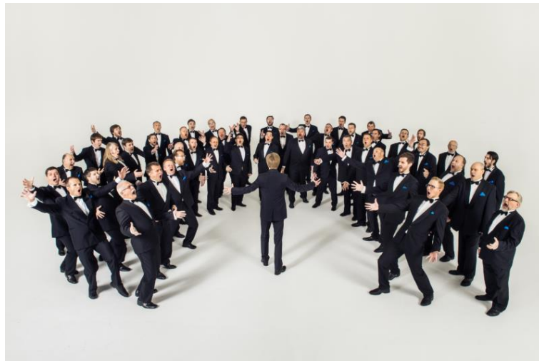
Estonian National Male Choir.

The Estonian National Symphony Orchestra , Tallinn Chamber Orchestra , and chamber choir Collegium Musicale will give portrait concerts to mark the 60th anniversary of the birth of composer Erkki-Sven Tüür during October.