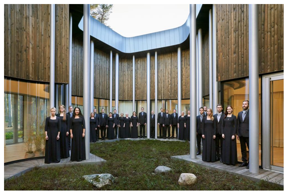
Estonian Philharmonic Chamber Choir.

Please check the \underline{\textbf{CALENDAR}} on the EMIC website for more events.