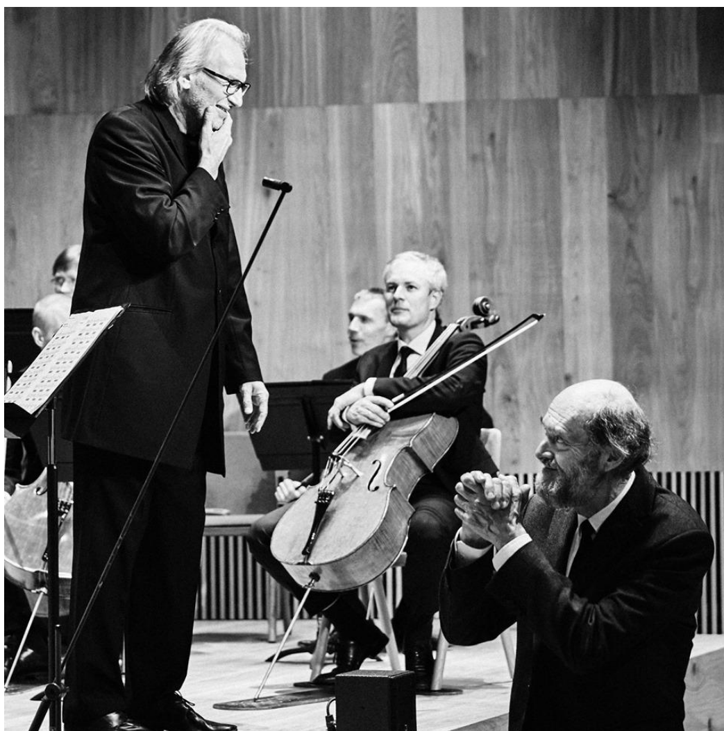
Tõnu Kaljuste and Arvo Pärt.

In the beginning of May, world-renowned choral conductor Tõnu Kaljuste was presented the International Classical Music Award (ICMA) in the category of Contemporary Music at a gala event in Lucerne, Switzerland. Kaljuste received the award for his recording of Arvo Pärt 's four symphonies with the NFM Wrocław Philharmonic Orchestra (under ECM). According to the jury, Kaljuste has been one of the most prolific and influential interpreters of Pärt's music for many years, who's distinctive treatment of Pärt's symphonies expresses the journey through various creative styles as well as a profound understanding of the composer's musical enquiry.