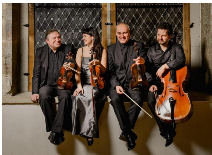
Tallinn String Quartet

See also: Tallinn Central Library, Palace Music concert series